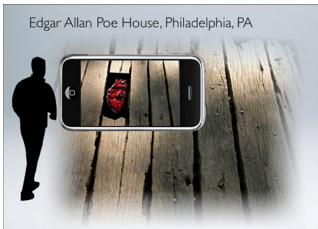
Fig. 2 Augmented reality projection of beating heart

The visitor has entered Poe's dark, nineteenth-century home. The visitor wanders around Poe's cellar and wonders if the walls of the dark, damp place inspired 'The Black Cat' (Poe 1984). Moving in the dark up the musty wooden staircase, the visitor feels movement on his leg. "No problem," he thinks, "It is only my mobile phone, and it couldn't have been a cat!" He looks at the phone but no one has texted him nor has he received an email. Returning the mobile phone back to his pocket, he continues up the stairs to a landing. Curious to see where the narrow old staircase leads, he decides to ascend the narrow staircase. As soon as he reaches for the stair railing, his mobile phone vibrates again. As before, he checks his phone; there are no messages of any kind. Ignoring this strange event, he quickly returns it to his pocket and continues moving upward. Atop the staircase he turns to enter Poe's sleeping chamber. Once in the cramped bedroom, his mobile phone begins to vibrate continuously. The vibrations seem to pulsate in his pocket. He pulls out his phone yet again. Finally, a message: